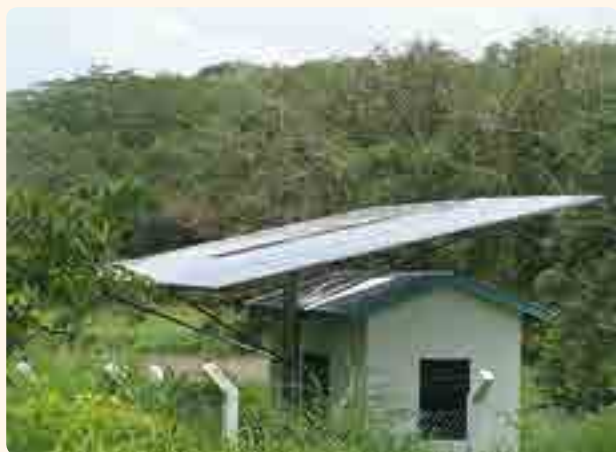
A 6.12 kW Solar Water Pumping System at Misufini Village, Mtwara (R)